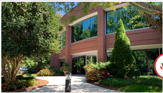
2841 PLAZA PLACE